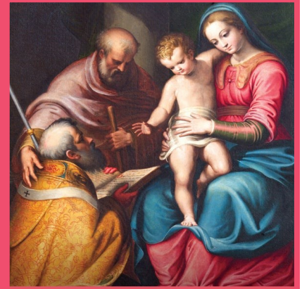
THE HOLY FAMILY

The child grew and became strong, filled with wisdom, and the favor of God was upon him. - Lk 2:40